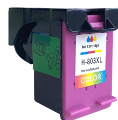
Color cartridge: $**/set