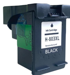
Black cartridge: $**/set