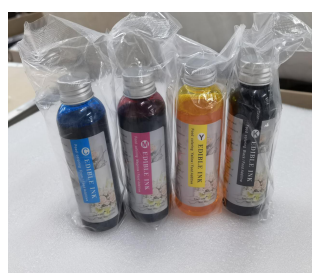
Edible ink: $**/set